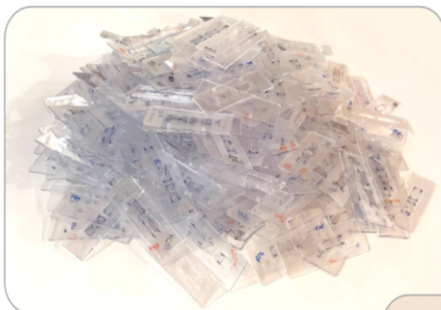
An example of single-use slides collected from a tissue culture lab in one week (approx. 450 slides)