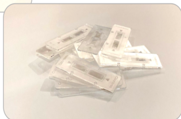
An example of recycled slides used by scientists in one week after their lab started to use iWash® (25 slides)